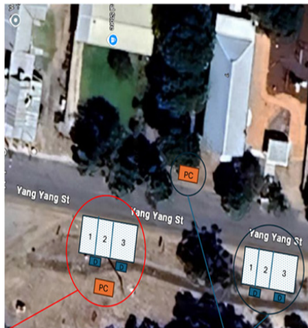
Note: drawing not to scale Option 2 (left) and Option 1 (right)

Power supply could come from the Hall or street feeder (subject to DNSP approval)